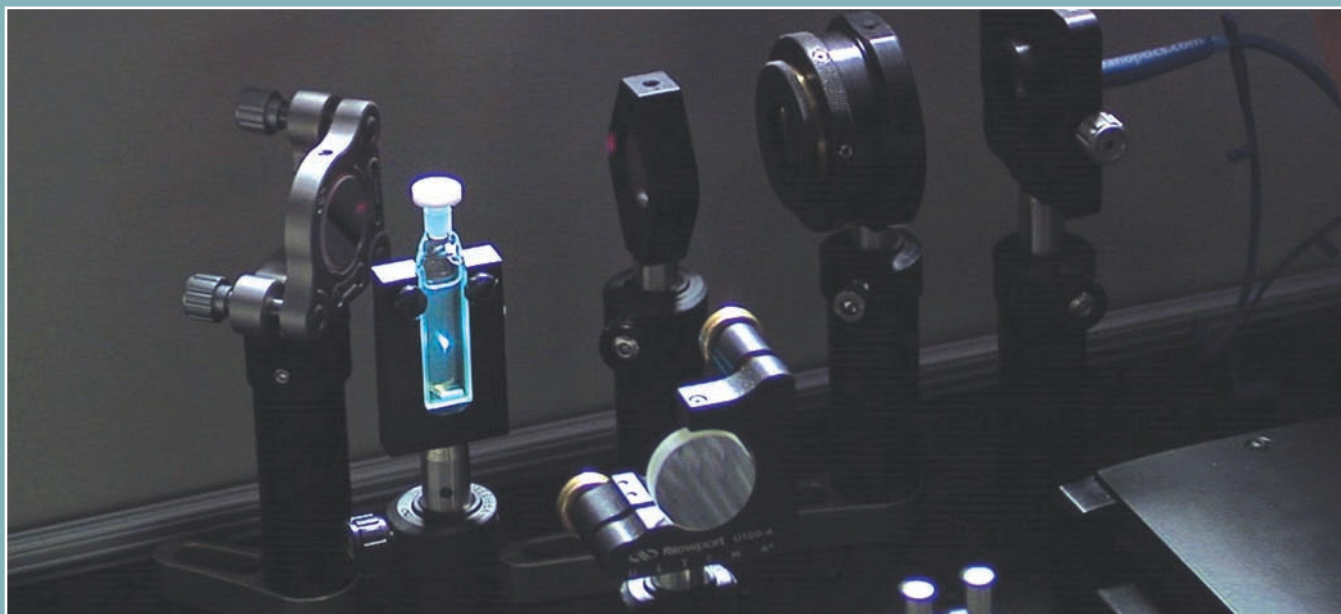
A sample is being excited by the spectrometer.